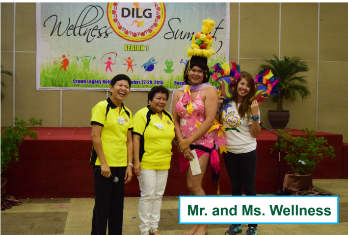
Mr. and Ms. Wellness